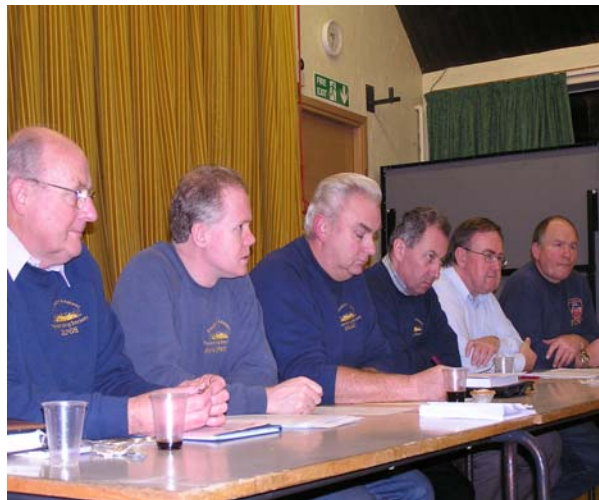
The new committee for 2006. From left: G1PGS, G7SYO, G8JAC, G6CJR, G8VXB and M3IGP.

The treasurer announced himself to be delighted with the turnout as he used the opportunity to collect 2006 subscriptions from everyone who attended. This was so successful that he ran out of receipts!