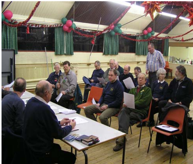
A healthy attendance for the 2005 AGM