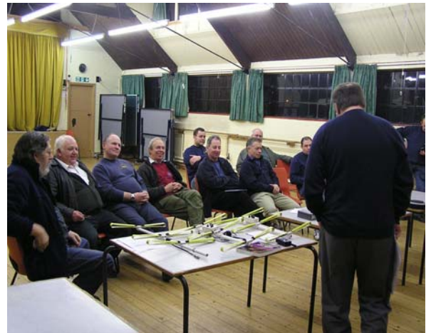
The attentive audience