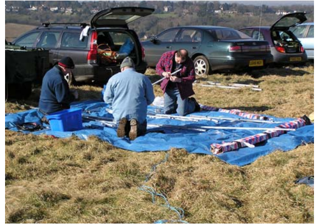
Setting up under way for the March VHF contest.

Almost a dozen members braved the sub-zero temperatures over the weekend of 4/5 March to put G4FUR/P and M1FUR/P on the air for the RSGB March VHF competition. Although we avoided the snow and high winds that affected the north of the country, it did get a little chilly with temperatures dropping to -5°C (23°F) overnight. Three hardy (or should that read mad?) souls even camped out in it. A full report on the operation and how we fared will appear in the next edition of CATS Whispers .