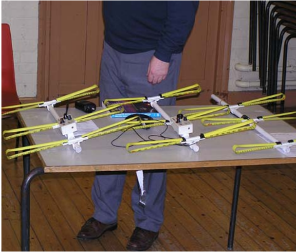
Three variations of the DF antenna on show.

The evening was presented by Dave G8VXB, who brought along some antenna kits that are available from G3ZOI. These feature a 3-element Yagi design for the physical antenna, that is constructed from spring steel tape-measure stock for the elements and PVC tubing for the boom.