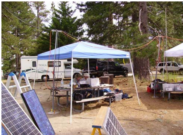
The HF CW station. Note the overhead power and comms cabling, and the solar panel assemblies that provided DC power for all the stations.

Len KA6KZZ then arrived on site with his mobile tower trailer. The story behind this was that the tower had been sold as surplus and offered for sale to the first person that could collect it. Steve KC6NFF had heard about this and made immediate tracks to reserve it. Len collected it and after it sat in his yard for a while, developed a means of combining it with a trailer. The tower uses electric motors to winch it from the horizontal to the vertical and a separate motor to winch the tower up in the vertical axis. Attached to the tower was a familiar 3-element beam and rotator. The whole exercise was effortless although a problem was discovered with the beam. It seems that it may have been assembled wrongly when it was previously used. As such, the elements were not in the right place. Len had to go back to basics, measuring each of the elements and traps and comparing them with the instructions. This was done, along with the other final preparations for the 11.00am start of the competition.