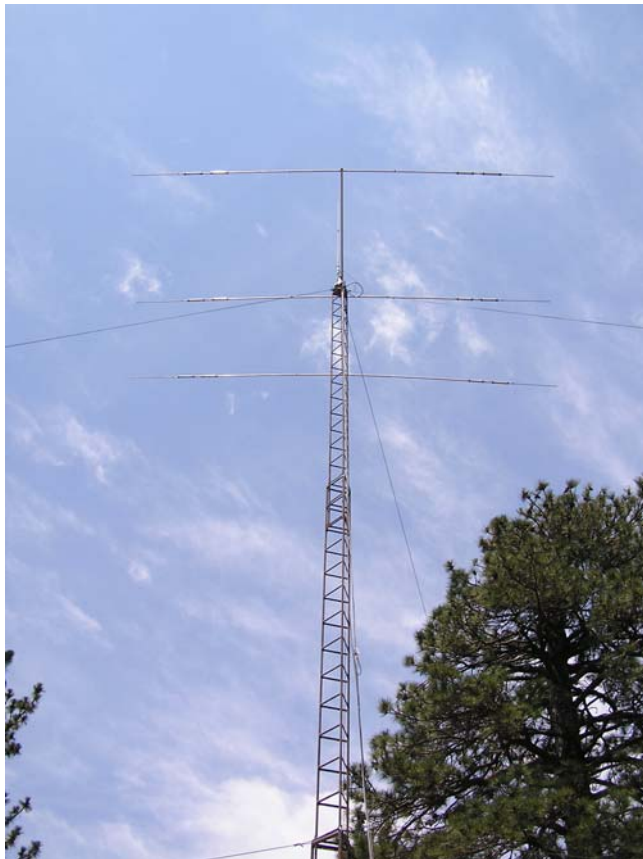
KA6KZZ's trailer-mounted mast raising the tri-band beam above the Ponderosa Pines at Lightning Point.

With only our RV to clean, tidy and return, the radio part of our trip was now over, but much, much more was to come. Our hosts had laid on a very busy program of things for us to see and do, and were intent on letting us enjoy what southern California had to offer.