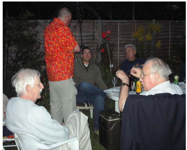
G8AAI and G6MFM discuss a point. G8NNT, M3JXN and G8JAC chat in the background.

The evening progressed, darkness fell and the conversations flowed. Ian did a sterling job keeping a supply of hot food coming and some lucky people even got "seconds"!