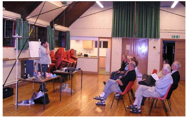
G3ZMF in full flow to an attentive audience

The essential subject of Earthing requirements was covered, introducing earth mats and radials.