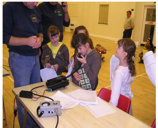
Making a contact. Another badge on the way for this Brownie.