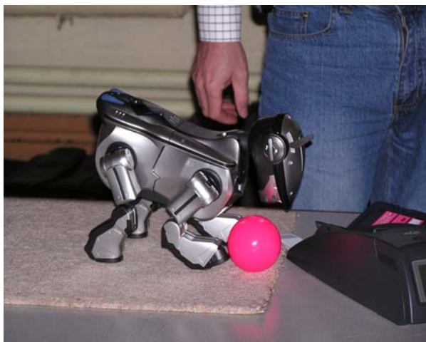
AIBO football in progress