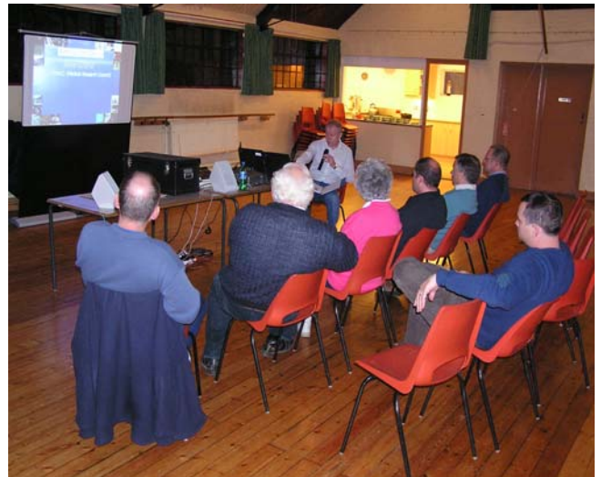
A sparse but attentive audience.