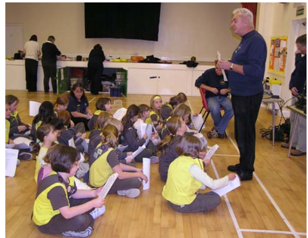
G8JAC trying to explain what was going on to a rapt audience. G0KZT and G3WZK look on.

A small display of radios was put on including a couple of military sets, a BC receiver, some police radios and a cell phone to illustrate different uses and the Brownies enjoyed themselves with a pair of 446 MHz handhelds.