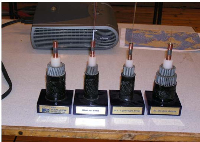
Samples of sub-sea cables were on display.

Until the invention of amplification, the only way to overcome losses over long distances was to make the cable low resistance; the need for robustness to resist natural and accidental damage meant cable weighing 9 tons per mile at the shore ends. The transmission of speech over such long distances was impractical until the invention of amplification in 1911, after which the problems of submerged amplifiers, reliability and power feeding had to be overcome.