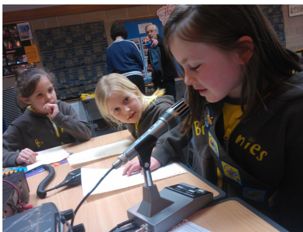
1 st Tatsfield Brownies in QSO with G6CKT & G8CKT on 2m, using equipment kindly provided by G0KZT