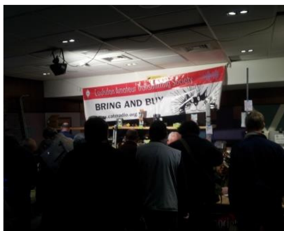
The Dark Corner of the hall that was home to the CATS B&B