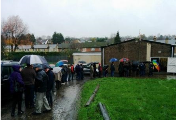
The queue to get in

The 37th annual CATS Bazaar took place on a very rainy Sunday November 23 rd . However, turnout was as buoyant as ever. Months earlier, there had been some doubt about whether the event would take place due to plans to redevelop the car park. Fortunately the event went ahead as normal – but only for this year (see below.)