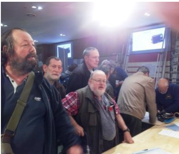
Customers looking for bargains

This year's B&B was one of the busiest for many years, with customers thronging several rows deep to see what was on offer, book in more, or make a bid for an item already on display. At least one person (a CATS member) sadly gave up the struggle to work his way through the crowd and see what was available, due to sheer weight of numbers.