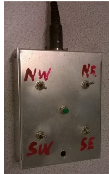
Garth's "Router" boxed up fully