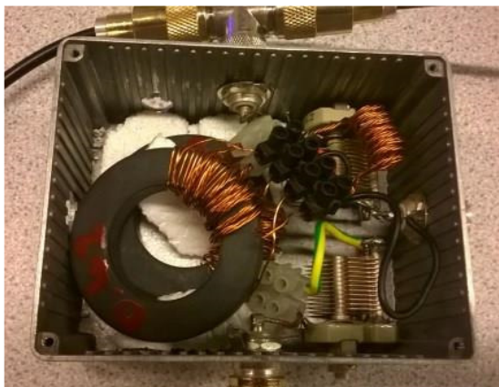
Matching Transformers and Power Splitting Box