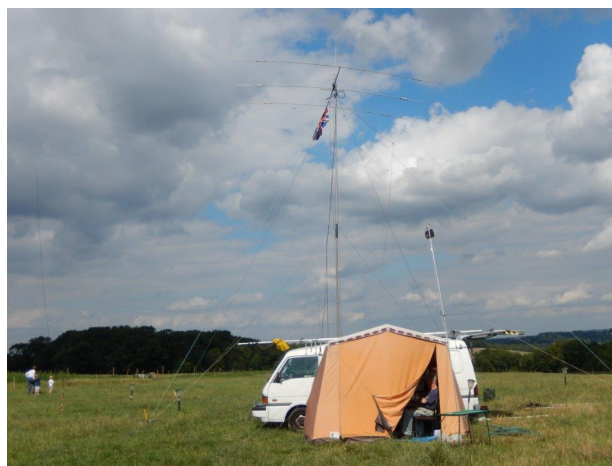
WDARS camp at Crossways farm

of the generators, his mast and HF beam, the latter two of which he explained how to erect by himself. My Army background would have had at least five people to do the job!