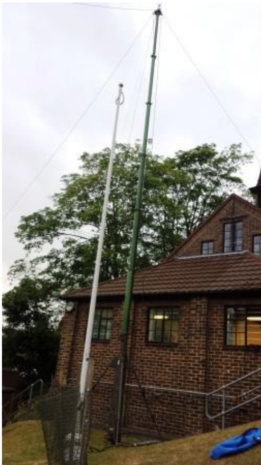
The antenna set up for our July meeting

Members were also invited to bring along any radio gear that they would like to experiment with.