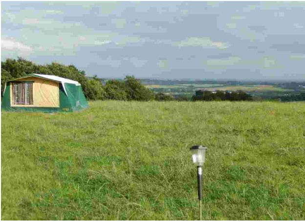
Reigate and The South