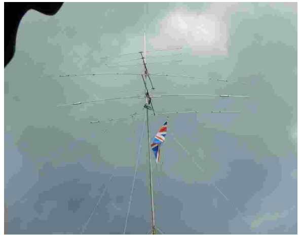
The antennas & Mast