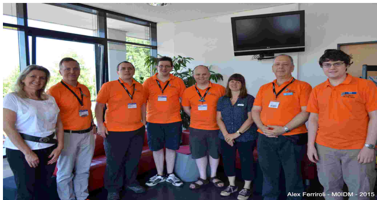
The team (in orange) at Friedrichshafen in 2015 (L-R) DD5LP, M6BOY, M0SGL, M0TCH, M1MRB