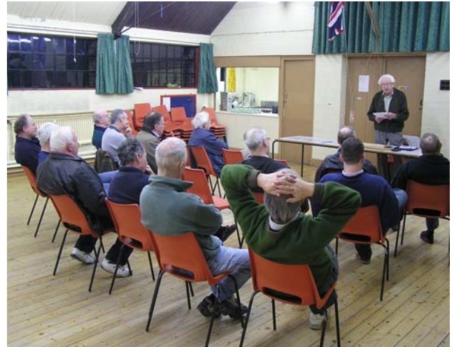
Rapt attention from the CATS audience

We learned that there were at least ten Colossi machines built, an initial version called Colossus 1, and further improved models known as Colossus Mk 2. However, these were preceded by a lesser-known machine given the name Heath Robinson after the famous cartoonist who was famed for drawing unfeasibly complicated machines to perform simple tasks.