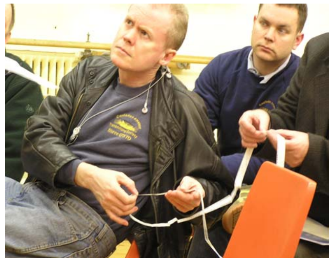
Hands on a piece of WW2 history at the Colossus lecture.