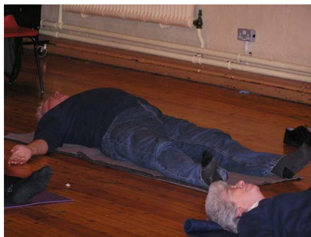
G8JAC practicing "deep breathing in"! G4RWW possibly asleep.

To demonstrate how to achieve complete relaxation, the hall's lights were dimmed to almost darkness and stretched out on our mats, we were taken by our instructor into a period of calm and relaxation. The technique was to concentrate on relaxing a specific one specific area of the body at a time until an overall state of total calm and relaxation had been achieved.