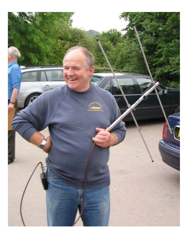
Ian M3IGP opted for a 2-element Yagi