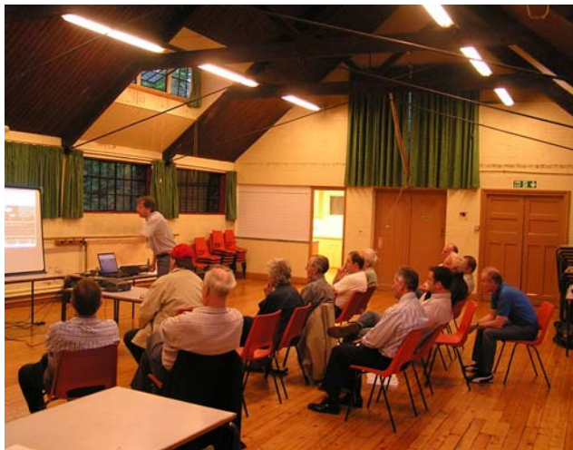
An attentive audience as G4FKK expounds on his remote system

Martin's rig that he uses for this application is a Kenwood TS2000, which is equipped for remote PC operation as standard, and Kenwood also supply proprietary software for use with it. This provides both-way information transfer i.e. changing something on the rig shows on the PC screen presentation and vice-versa, and uses an RS232 connection between the rig and the controlling PC.