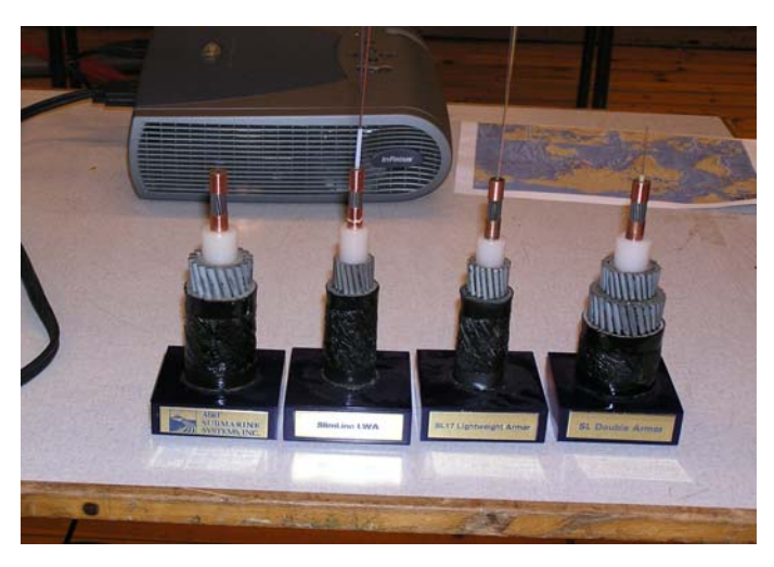
Samples of sub-sea cables were on display.

Until the invention of amplification, the only way to overcome losses over long distances was to make the cable low resistance; the need for robustness to resist natural and accidental damage meant cable weighing 9 tons per mile at the shore ends. The transmission of speech over such long distances was impractical until the invention of amplification in 1911, after which the problems of submerged amplifiers, reliability and power feeding had to be overcome.