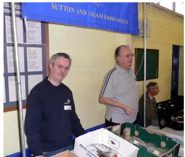
The Sutton and Cheam club supported our bazaar with their stand.

CATS members were again manning our Bring & Buy facility that proved popular last year and there was a touch of sadness as we were also disposing of the radio property of Derek G6MFM in a Silent Key sale. The tables were our usual mix of local traders, club stands and individuals and it was pleasing to hear comments such as “it’s good that there are still real radio rallies without loads of computer junk and fluffy toy stands”.