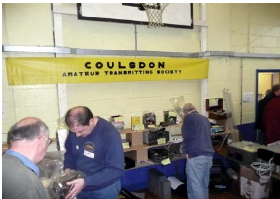
The CATS Bring and Buy table and Silent Key sale.