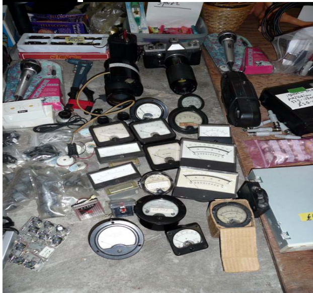
Meters for all on the G3ZMF/G8AAI stall.