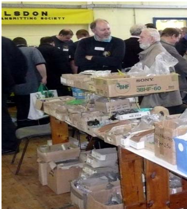
G8MNY always has a good range of vintage components on offer.