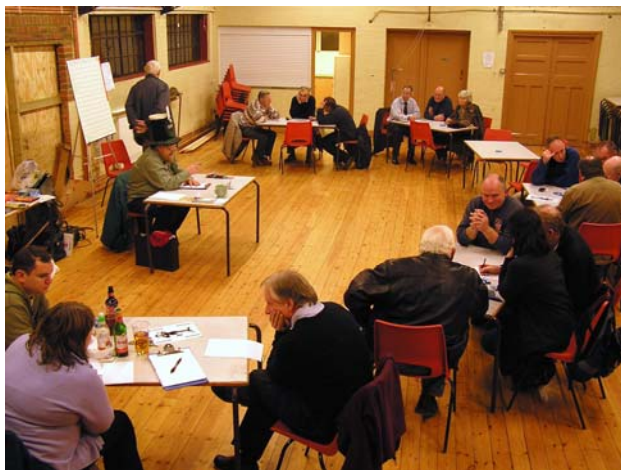
The assembled teams pondering a question.

Although we had invited neighbouring local clubs to enter a team, in the event none took up the challenge but we were pleased to see a couple of visitors and XYLs turn out for the evening. After assembling into teams of three or four and setting out our favoured forms of refreshment we settled down to choose names for the teams and then Frank was off at a brisk pace with rounds of ten questions – some easy, some aggravatingly obscure.