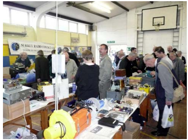
A view down the hall when things had quietened down a bit.

Just before 10am the doors were opened and the scrum began. We had 140 visitors who paid at the door and adding the sellers and helpers and CATS members who came down, that makes going on 200 people happily buying, selling, browsing and socialising.