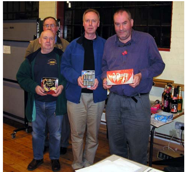
The victorious Klerryx – G6YOG, G8VXB, visitor and G8NNT after receiving their prizes from G3ZMF.

After a happy hour and a half or so’s brain wracking, a quite close set of scores revealed that the team playing under the title of “The Klerryx” came out the winners with a score of 49 points. Runners-up were the Katz 22 team with a score of 43.5.