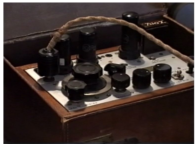
The Waddon Mk 7 spy set of the type used to send “QZB”

As for “QZB” – it simply means “I am being bombed”!