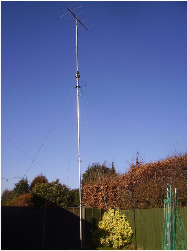
A beautiful but cold day for a contest in the 'KZT garden

“The following day turned out to be brilliant sunshine. Family duties delayed my return until around 11.00am after I was told to go shopping (where I also called into the CATS Net). I was able to generate a few extra contacts once the net had concluded. Again family duties caused me to have to close down just after 12.35pm. The fruits of my labour were that I managed just 35 contacts on 2-metres and 11 on 70cms. My furthest contact on 2-metres was with DF0MU in JO32PC at 518 Km but on 70 cm was only 162km with G5B in IO92WS. My total score was only 3869 points (1 point per kilometre) so no silverware is expected, even more so as I entered the single operator fixed station category. I did manage to work Frank G3ZMF while he was using the G4FUR call sign, one of the rare occasions that both club call signs have been used together from different locations.