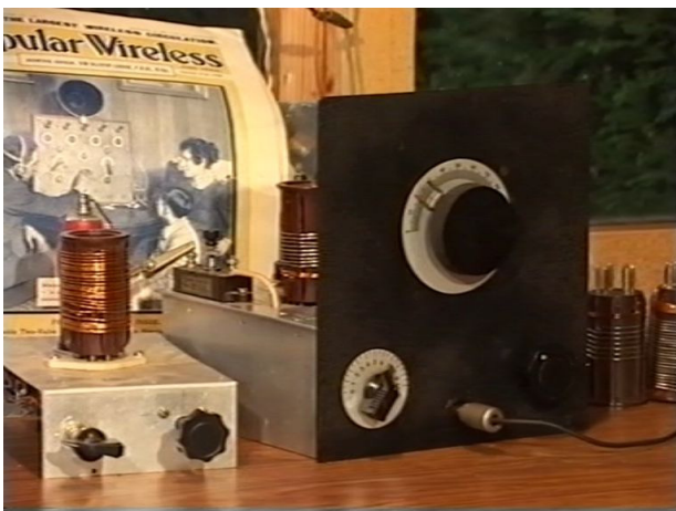
Rebuilt 2 valve Eddystone Short Wave All World Two as used by Mr King when working as a Voluntary Interceptor