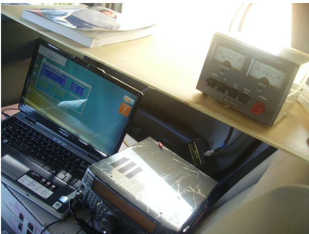
The operating position used by Andy, G0KZT

“To limit the impact on family life (my voice booming out from the shack), I decided to operate from the car positioned on the driveway and converted my 5 door hatchback into a surprisingly comfortable operating space.