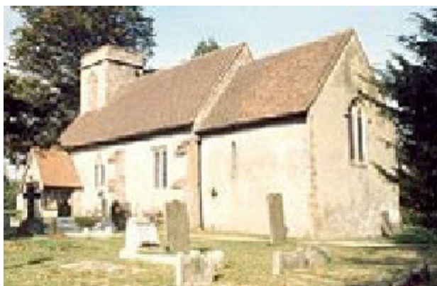
St Mary's Tatsfield

The venue for this event was St Mary's church, Tatsfield, a wonderful old stone building originally built in 1075. Set on the edge of the North Downs and 240 m above sea level, it is in an excellent location radio-wise.