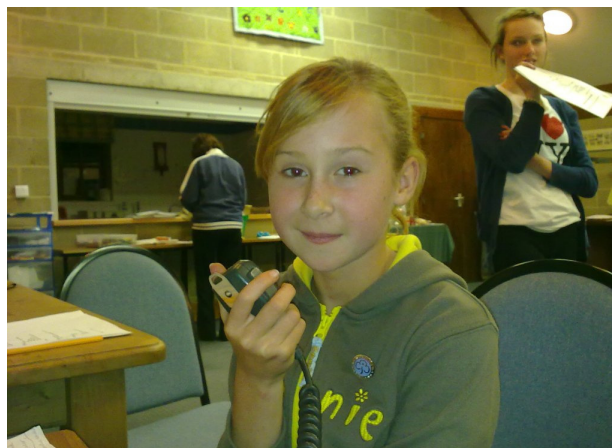
One of the Tatsfield Brownies on the air

A selection of photos, all courtesy of G0KZT, follows: