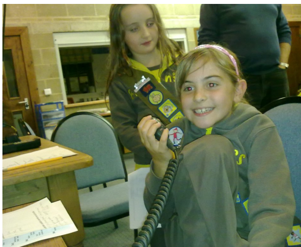
Two more enthusiastic young operators