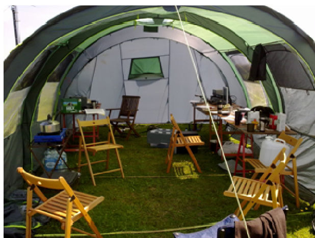
The main operating tent that doubled for messing

"I had to make two trips to the site because of the amount of kit I took, both of my own but of the club's too. It was a real sight to see the SCAM12 loaded into my Ford Fiesta, much to the amazement of the guys on site. My thanks go to Stuart for bringing it back for me in his minibus. So much easier!