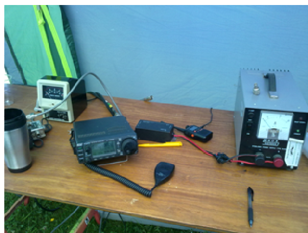
Operating position 2 – Club IC-706 with 2 nd rotator controller

"I had spent a lot of my time rigging and trying to get all the different bands operational. Meanwhile operation continued in G3ZMF's and G0GNQ's tents on 23cms and HF respectively. The site was a real hub of activity!