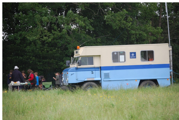
"Alice" – see text

was used in the 50's and 60's as an outside broadcast repeater vehicle. It was specially designed for the purpose and is today converted for use as a caravanette. Kept in its original colours and signage, it was a useful addition to the station and, being four wheel drive, was able to surmount the toughest of field conditions.