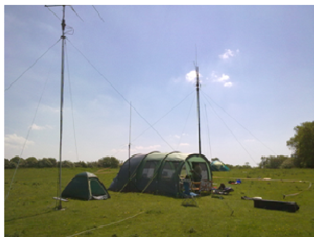
The masts & the operating tent

"I would like to add my two penny's worth regarding the first ever CATS Playday weekend. My first thoughts are about the weather. It was regrettable to have to postpone the event by a week but how lucky were we with the weather! Blistering hot sun (although a bit windy) which will turn out to be the only sunny weekend probably of the whole summer!