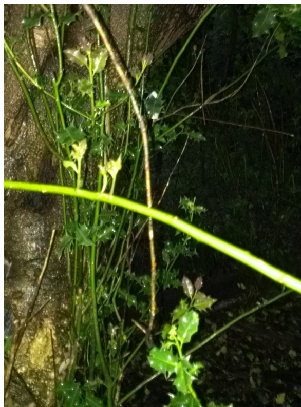
Spot the hidden transmitter?