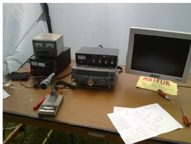
Operating position 1 - Kenwood TS-2000 with rotator controller

"The same happened again on the Saturday with a CQs at 1800 BST and 2000 BST yielding 25 QSO's . Operation that night continued until 0040 BST with further operation on 2 metres and 40 metres.