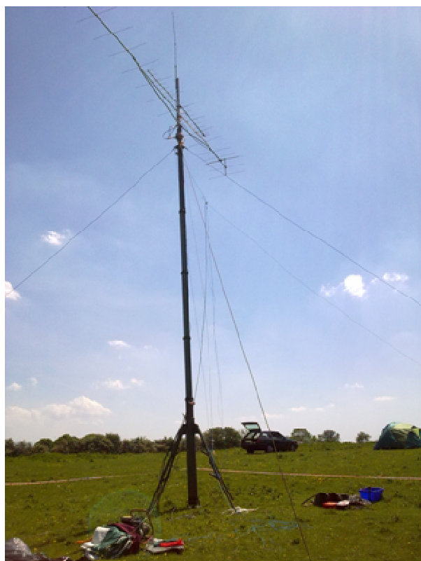
One of the SCAM masts bearing the 2m & 70cm beam & 4m co-linear

"The site turned out to be a real winner and I hope we can return there in the future. The "take off" was amazing with the South Downs clear to the south and The Chilterns to the north. With no main road nearby we were not overlooked and had the added security of an electric gate on the approach road.