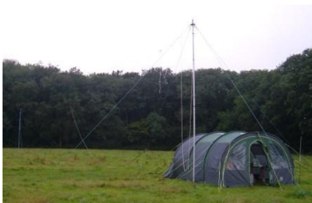
The CATS station at Crossways Farm