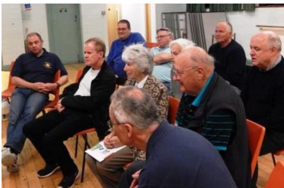
The audience on May 11 th