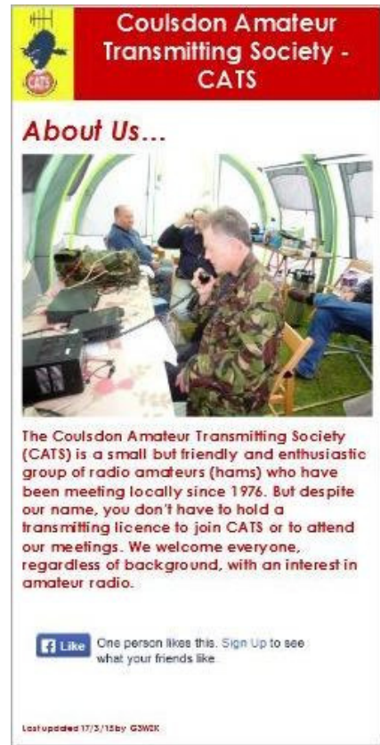
The "About Us" page of the mobile version of the website

The site includes a gallery section with albums of CATS events organised by year and also a comprehensive library of back issues of CATS Whispers. If any members can help us to fill the gaps, please would they contact Steve at g3wzk@catsradio.org