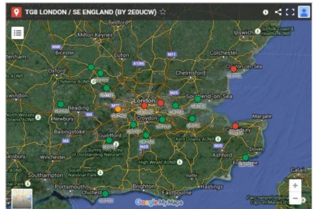
Map showing DMR repeaters in SE England

One of the big benefits of DMR is that you don't have to QSY (change frequency) when driving around and travelling through the catchment areas of different repeaters.